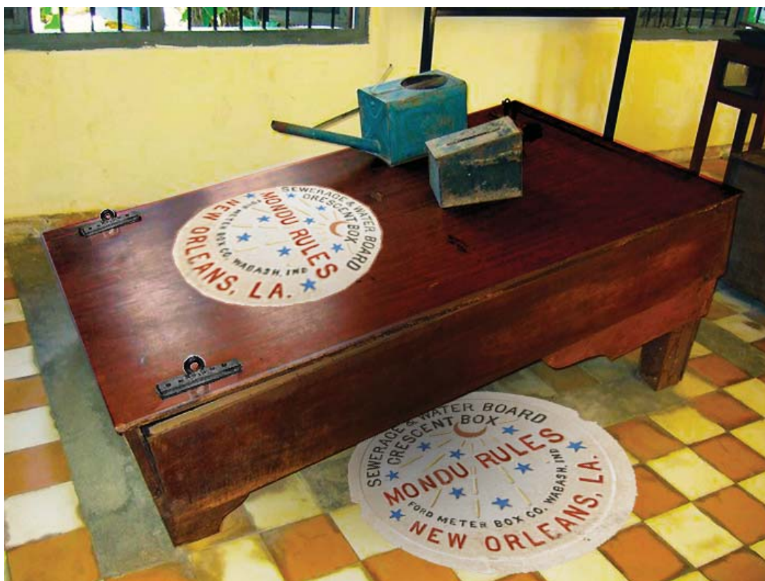
Sewerage and Water Boarding

Only time will tell if this announcement will pay any dividends, but frustrated citizens seem ready for action. A march is scheduled for January 27th through the Bywater and French Quarter, where pimps and hoes will be on hand to throw their money down the drain. Citizens are hopeful that the Sewerage and Water Whores will be there to suck up the mess.